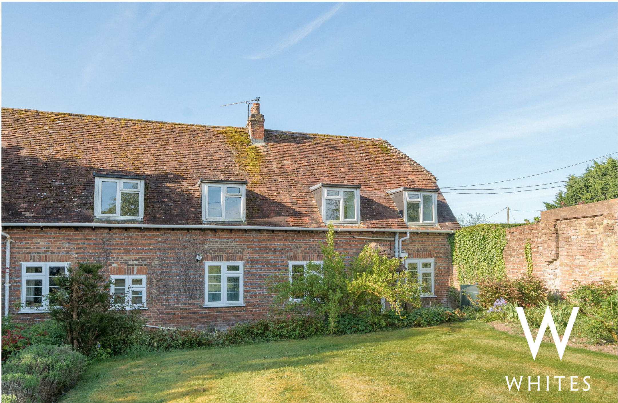
2 Courtyard Cottages Whiteparish, Salisbury, Wiltshire, SP5 2QE